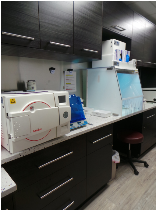
Onsite Closed System Sterile Lab