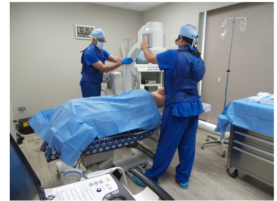
Using Fluoroscopy Guidance for Spine Procedures